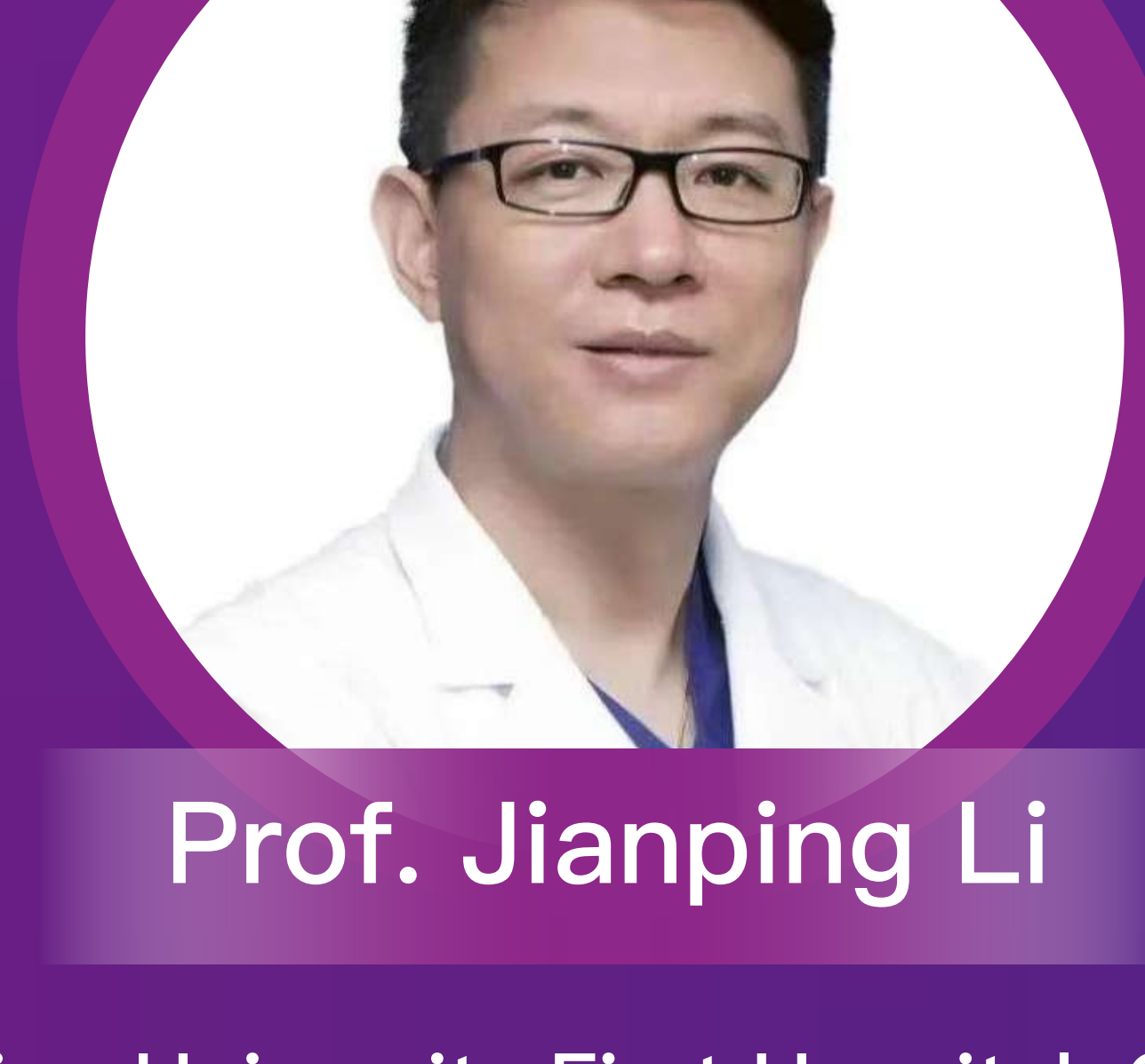
Peking University First Hospital, China