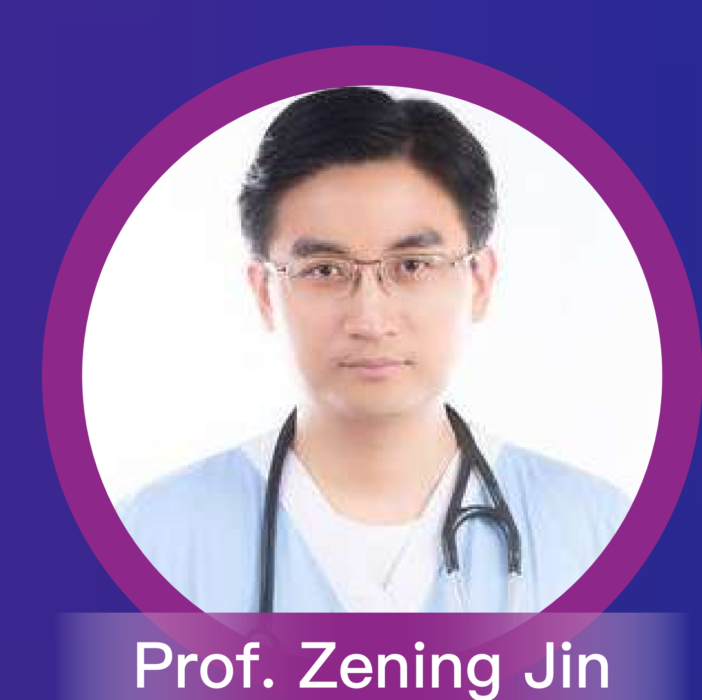
Beijing Tiantan Hospital,