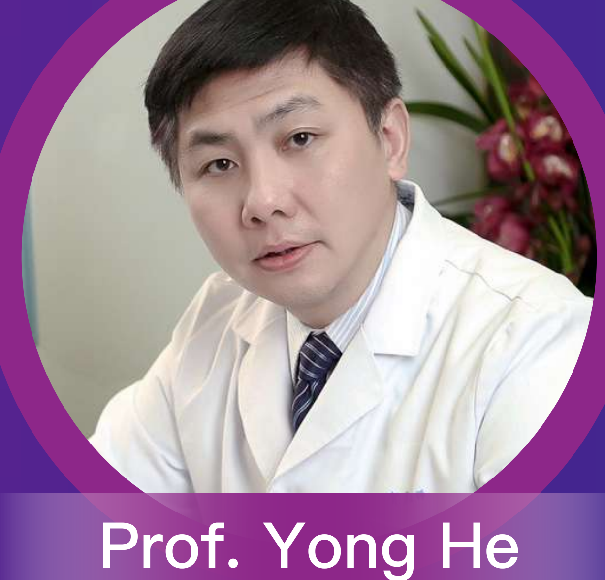
West China Hospital,