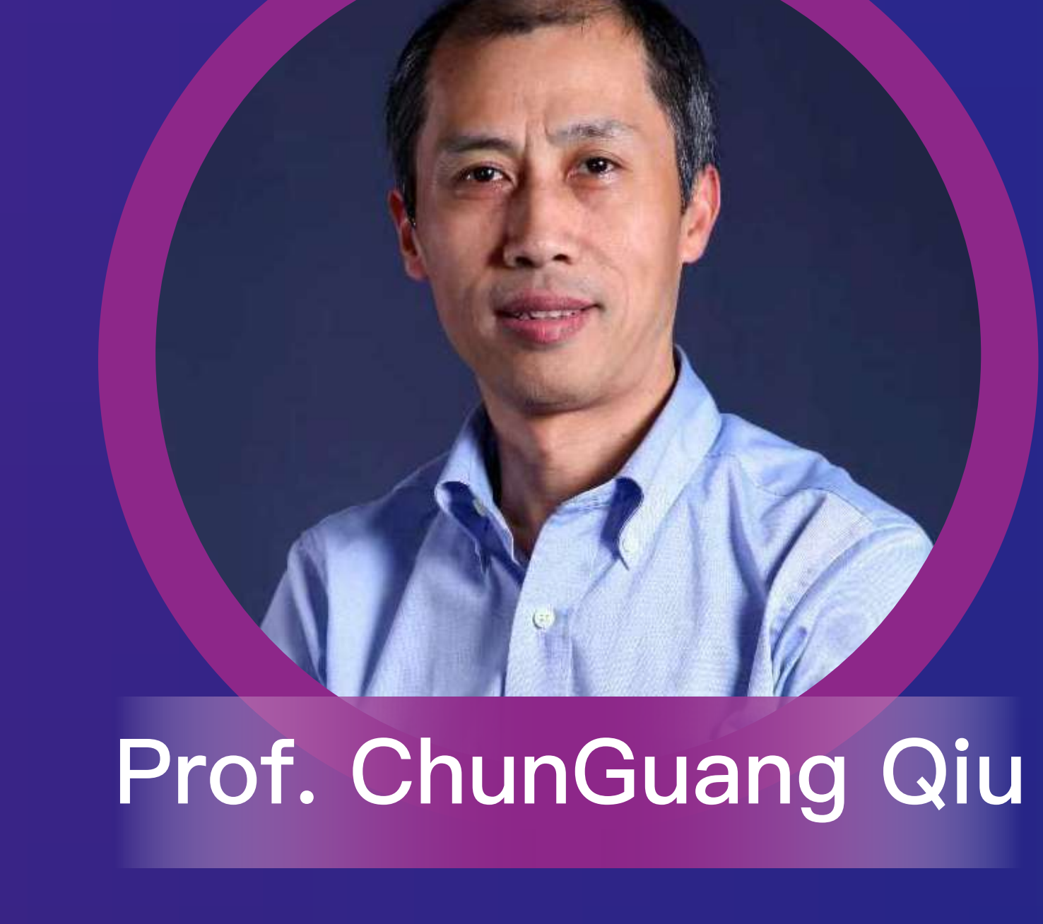
The First Affiliated Hospital Of Zhengzhou University, China