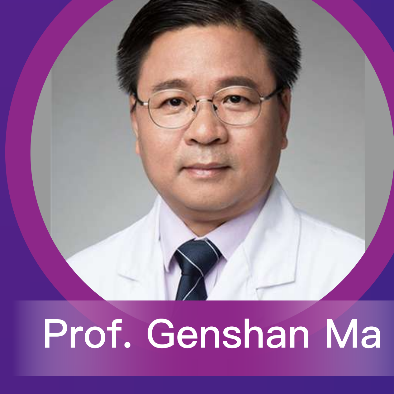
Zhongda Hospital Southeast University, China